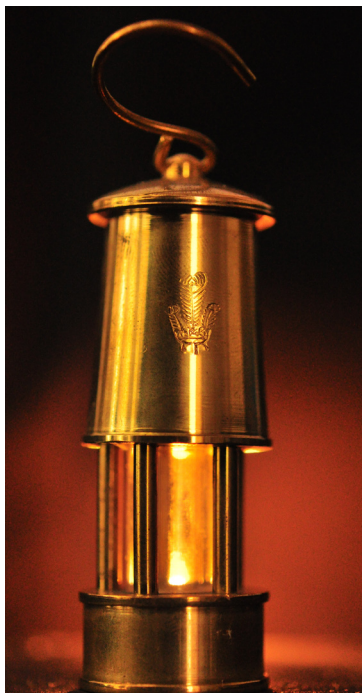
B grade - Song Title - Highly Commended Geoff Brokenshire - This little light of mine