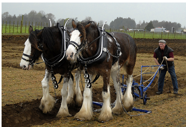
B grade - Open - Merit Caron Stewart - Hitch it to the horse