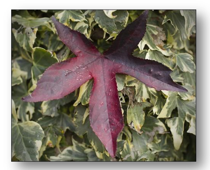
B-Grade: Liquid Amber A lovely leaf better on a less complicated background. If this was my photograph I would turn it into something arty. Merit.