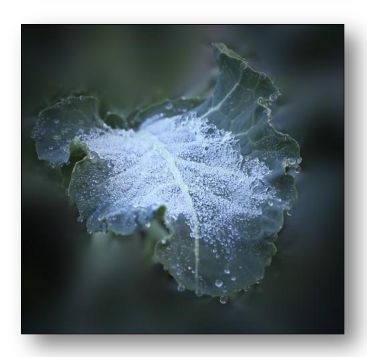
B-Grade: Jack Frost A very effective photograph. A lovely background, out of focus but in the same tones. That draws you to the leaf pattern and drops. Honours.