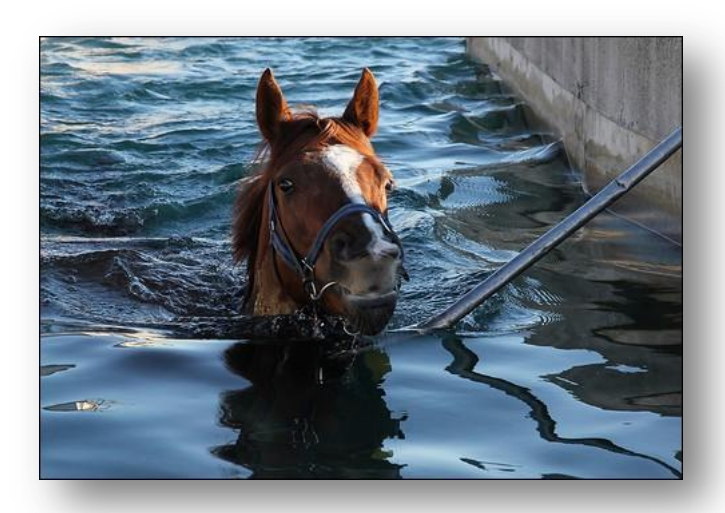
B-Grade: Mr Ed Takes A Bath Good colours and action ion the water. I like the angles of the horse, the wall and the pole. Highly Commended.