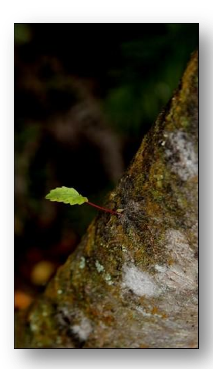
B-Grade: New Leaf

There are some lovely tones in this photograph. The leaf looks dramatic in scale against everything else but a tighter crop would have achieved the same thing. The lighter area on the trunk catches your eye. Acceptance.