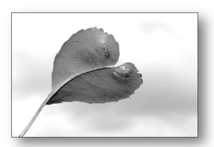
B-Grade: Heart Shaped A very effective black and white photograph. You have used the curve of the stem well, and given space for the leaf to reach in to. There is a lovely subtle toning in the background. Honours.