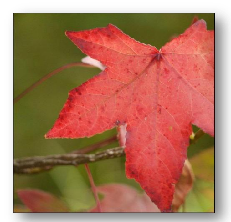
B-Grade: Large Autumn Leaf I like the crop you have made – quirky. If you had stood a little to the right it would have hidden the highlights on the leaf behind. Highly Commended.