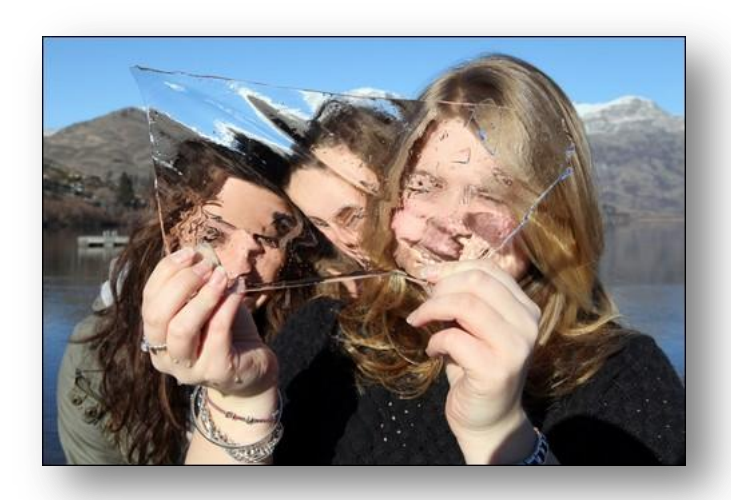
B-Grade: Icy View This is a clever idea and good fun to do. To make the picture look more abstract try cropping to the edges of the ice so that the picture is less about her hands and more about the distorted faces. Merit.