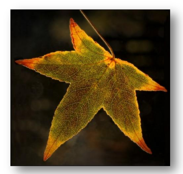
A-Grade: Patterned Beautiful angles and colour, with a soft barely-there background. You can appreciate the transparency of the leaf and clearly see all of its veins. Honours.