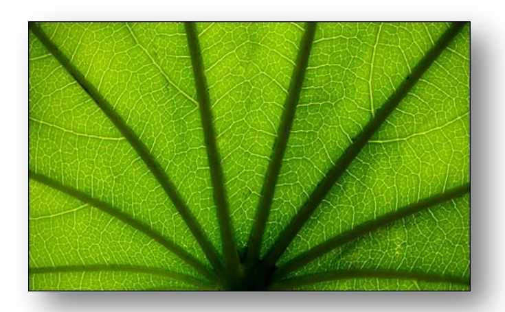
A-Grade: Green You have brought out the lovely fan shape of the leaf with all of its arteries and veins. A very pleasing photograph. At a lower grade I would give it Honours, but I feel that you could be a little more creative with the angles. Highly Commended.