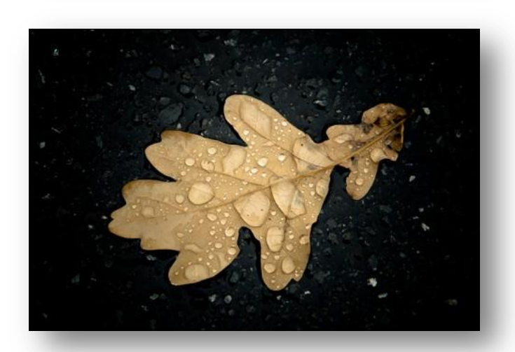
A-Grade: Fall A lovely sharp photograph. The photographer has stood at an angle the sweeps the leaf through the photograph. I like the darkened background as it makes the leaf glow. Honours.