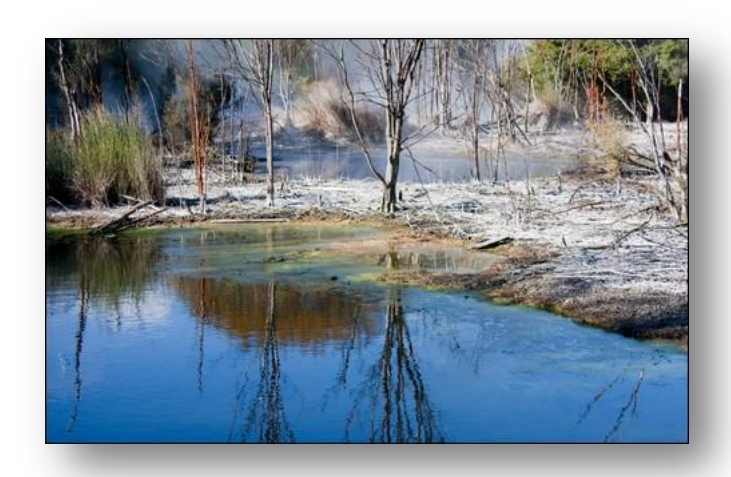
B-Grade: Healing Waters There are lovely colours in the picture and it looks sharp. Your eye roves around looking for something to focus on. Was it the reflection that you were drawn to as there could be a good picture there? Revisit the area and take more photos. Merit.