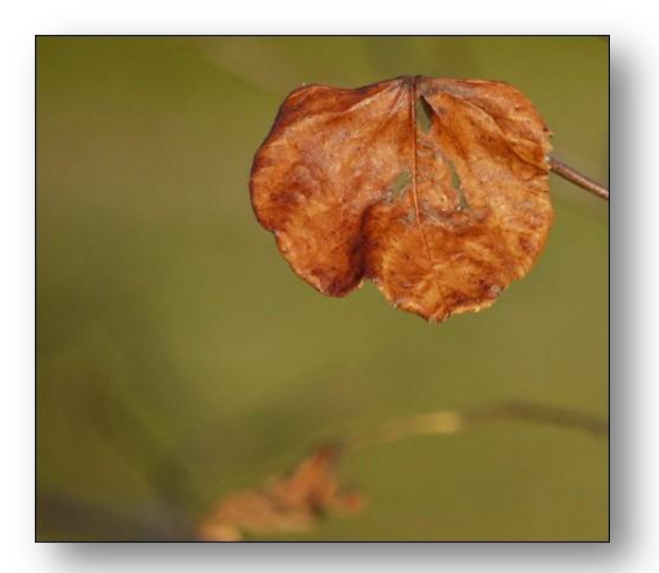
B-Grade: Autumn Leaf A lovely complimentary tone in the background with the leaf. I like the balance of the hint if the other leaf and stem, it shows how good a dried up leaf can be. Honours.