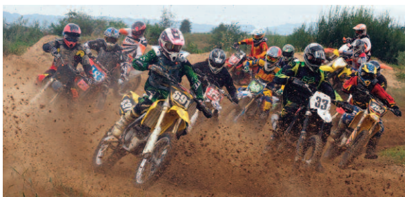
Race for the Lead