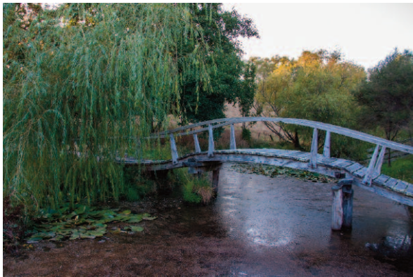
Bridge Over Troubled Waters Sue

A very tranquil scene, but remember photography is story telling and about light. The bland sky takes my eye away from the charming bridge. I get the feeling the light was about to become dramatic, or that you just missed it.