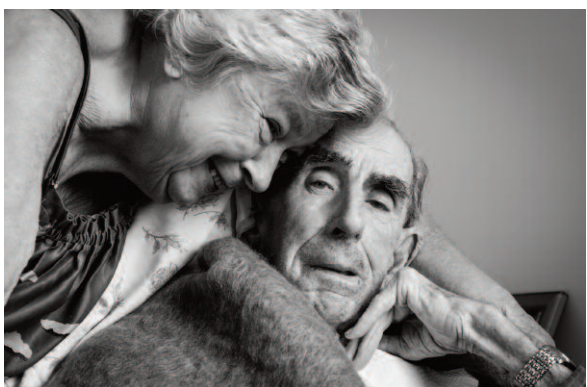
A Life Time of Togetherness

This is very well cropped, I like the story here very much. It is a tad flat, I added some contrast and brightness and it came alive? Highly Commended