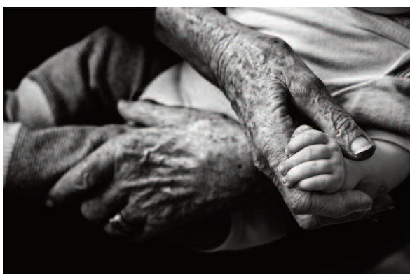
A to Z