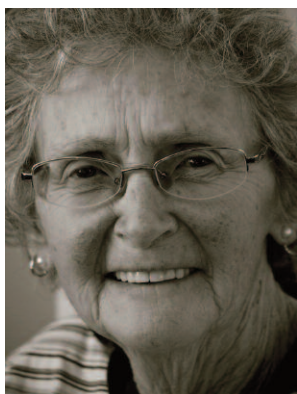
79 Wonderful Years

This has a slightly posed feel to it, the woman is smiling at nothing visual.. perhaps she could have looked at him? The large blanket is rather dominant. A strong concept but not quite putting across the emotion I hoped for. Merit