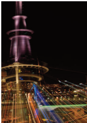
Auckland Sky Tower