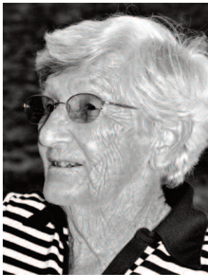
Mother at 86