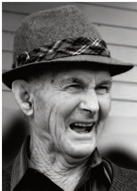
Laugh Out Loud