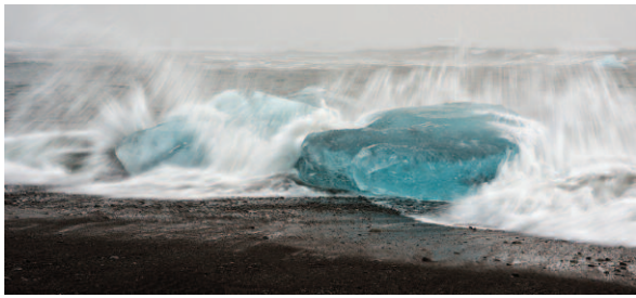
Battered Ice Cube